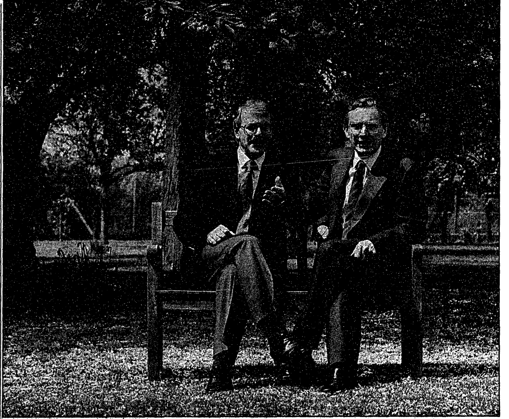
Benchmark... John Major at home at Great Stukeley, near Huntingdon, with the next chairman of the Conservative Party