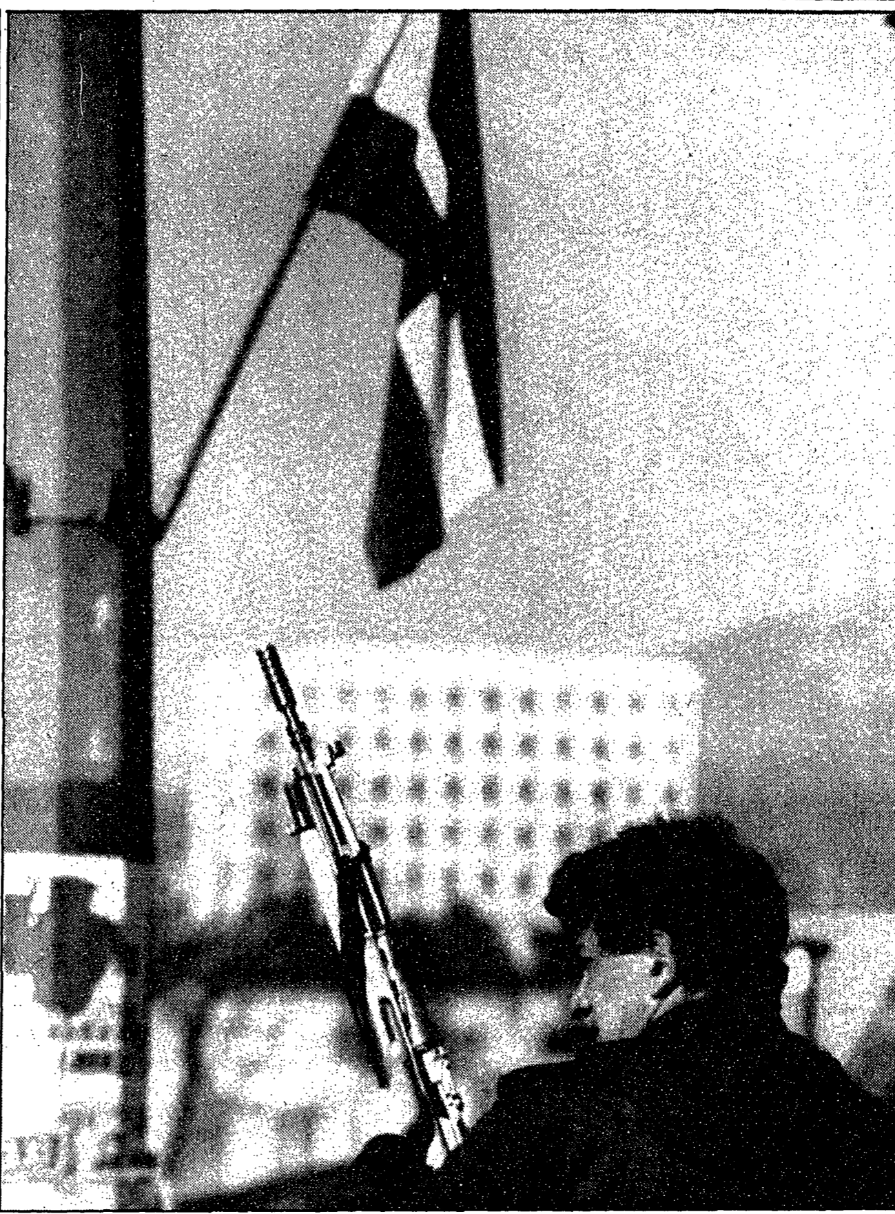
Up in arms... A Serbian gunman stands under the Yugoslav flag in Sarajevo, prepared to fight to prevent Bosnia-Herzegovina leaving the federation. The republic may be on the brink of civil war.

the introduction of male staff on female wards has "not always been carried out sensitively" and that staff need training in handling sexual and other emotional tensions.